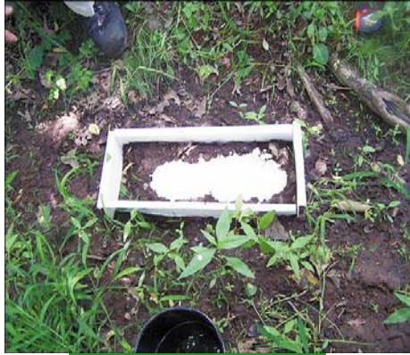
Track being cast in Oklahoma by the MABRC during their Memorial Day 2008 Expedition.

“The following states are available at the MABRC Forums, Arkansas, Missouri, Kansas, Louisiana and Texas, as well as Oklahoma.