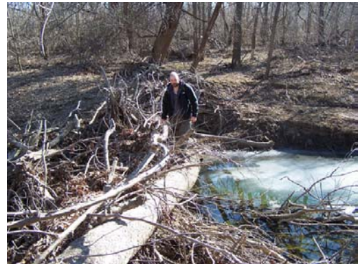
Stooge finding a way across the creek

Next newsletter, we look at the sketches of the one belly-crawling up to the camp on the expedition.