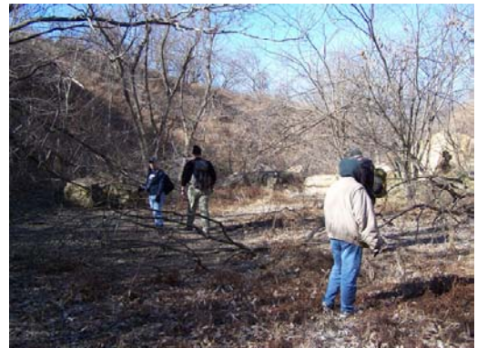
The flushing team in the strip mines