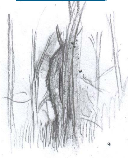
Sketch by MABRC Researcher Biggimm based on MABRC Researcher Darkwing's sighting.