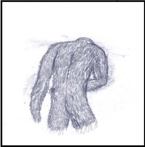
Sketch by MABRC Researcher Biggimm based on MABRC Researcher Bighead's sighting..