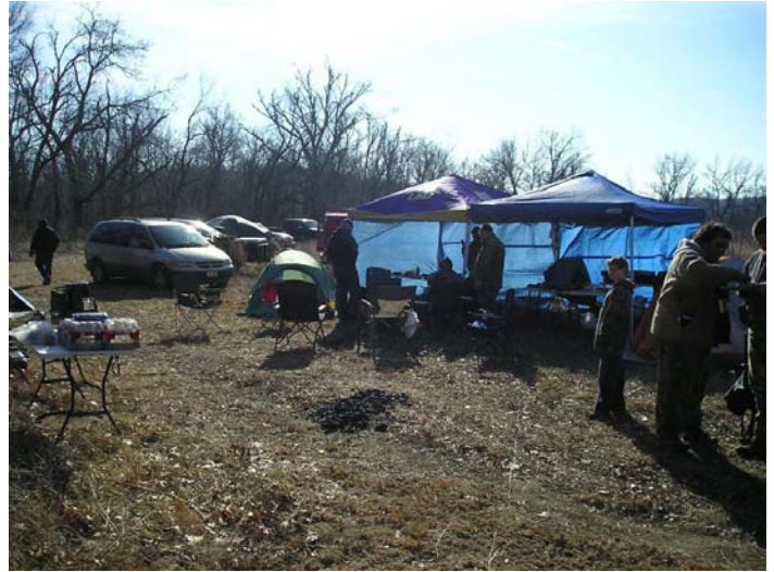
The field where the belly-crawler was seen is seen behind the vehicle in the picture above.

the nearby calls where being made to pull our attention away from the field. i felt bad for losing it. my guess is that it waited until it couldn't see the IR on it and took off. the whole experience lasted 4-5 minutes."