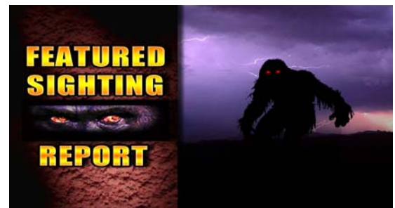
BFGTV Segment Title Screen about Featured Sightings reports.