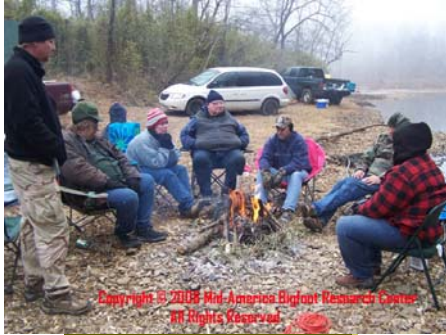
The January Expedition crew around the campfire.