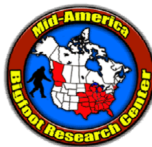
The MABRC Logo

ter, we have evolved into the MABRC in early 2007, in which we now have over 70 research-