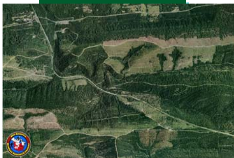
Overview of the area at Honobia where the expedition took place at.