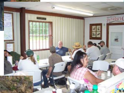
The MABRC team eating breakfast at Shawna's Place.