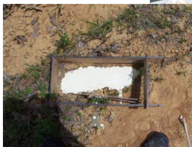
The cast is drying under the watchful eyes of the MABRC Team.